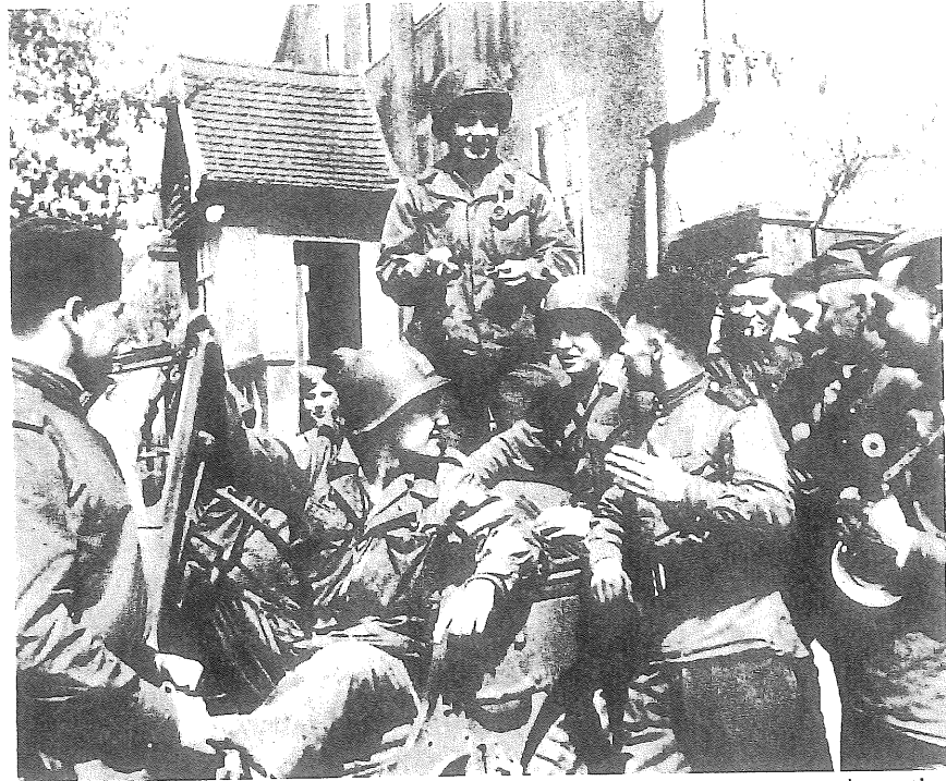
U.S. and Soviet soldiers meet on April 27, 1945 in Torgau, Germany along the banks of the Elbe River.

The following pages are built around selections from letters, speeches, interviews, and memoranda written while the events