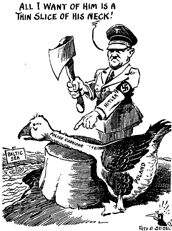
Fred O. Seibel in the Richmond Times-Dispatch , 1939. Used with permission.

4. What do the two political cartoons below suggest about the difference in American perceptions of German aggression and Japanese aggression?