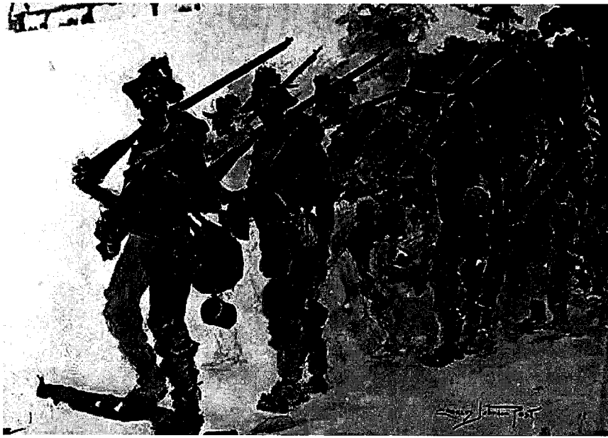
U.S. troops in Cuba suffering from tropical diseases, by Charles J. Post.

black soldiers had a much lower rate of desertion and discipline problems than their white counterparts. Nonetheless, they were denied promotion into the officer corps.