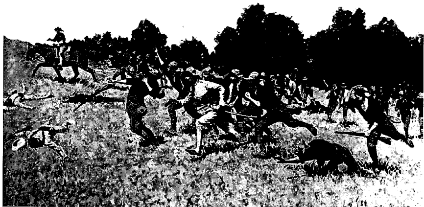
Charge of the Rough Riders, as painted by artist Frederic Remington.

After the Civil War, military service had been one of the few avenues for advancement open to blacks in American society. The army's four all-black regiments (each comprised of four hundred to eight hundred troops) were ranked among the country's most elite units. Stationed mostly in frontier posts,