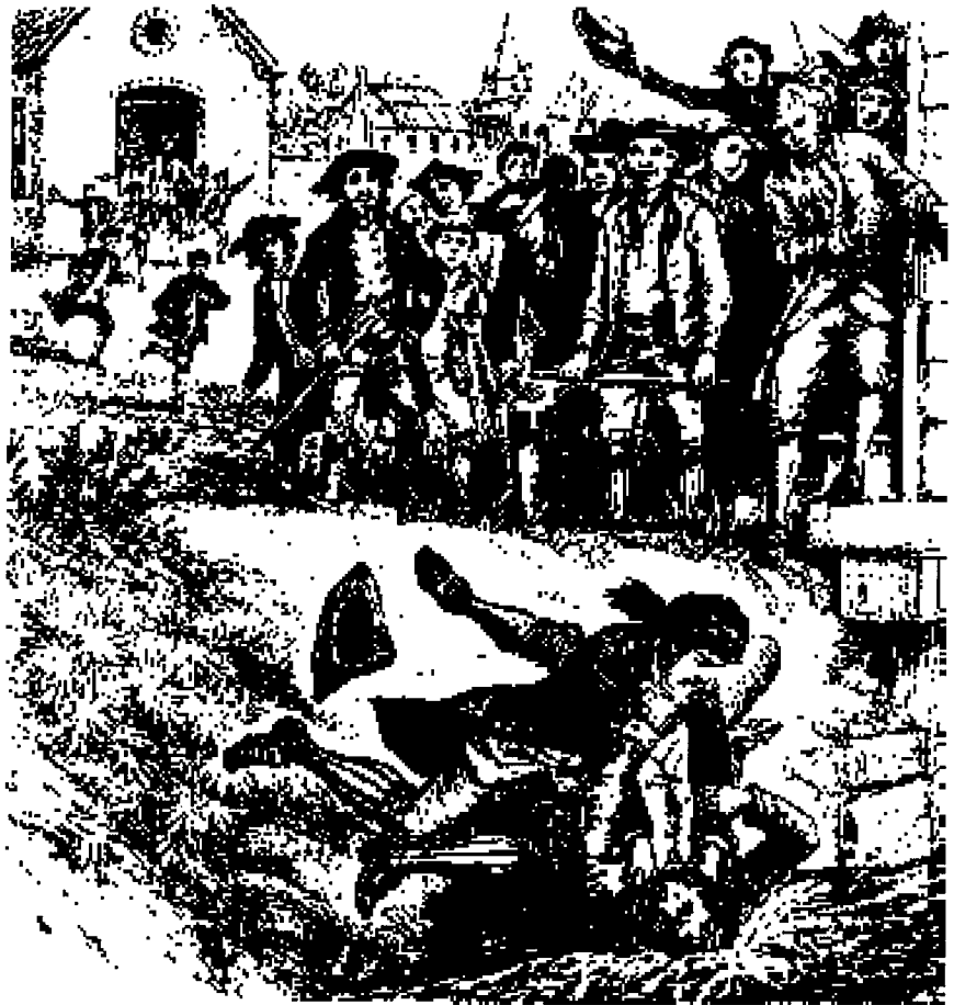
A farmer is shown attacking a local official in the Shays’s Rebellion.

Many of the issues raised by Shays’s Rebellion continued to simmer as delegates from